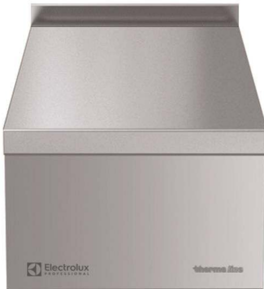
588563 (MBNABDDOOO) Closed Work Top, one-side operated with backsplash